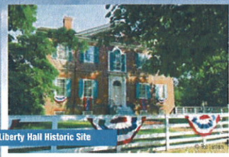
Liberty Hall Historic Site