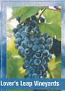
Lover's Leap Vineyards

tasting to all guests. Home of Kentucky's first "Sparkling Wine". You may picnic on the veranda or stroll through the beautiful vine- yards. You will go away with a lasting impression. May-October 11:00-7:00 November-April 11:00-5:00 Gift Shop: 502-839-1299 loverleapvineyardky.com