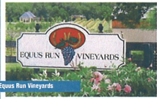
Equus Run Vineyards