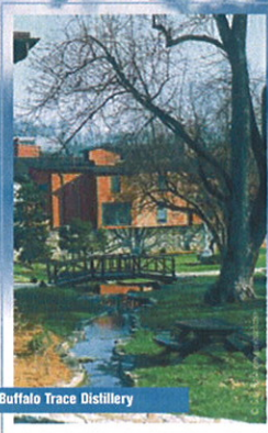
Buffalo Trace Distillery

Self Guided Tour $4 Tue-Sat (10am - 5pm) (502) 564-1792 / (877) 444-7867 history.ky.gov