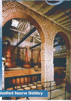
Woodford Reserve Distillery

From Lexington and I-75, I-64W, exit 69; From Louisville, I-64E, exit 65 1280 Moores Mill Rd (859) 846-9463; toll-free 877-905-2675 www.equusrunvineyards.com