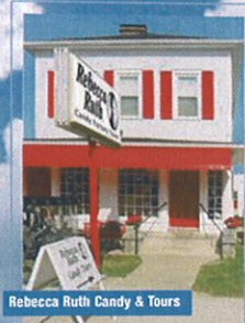
Rebecca Ruth Candy & Tours

Award winning winery and vineyards renowned for the quality and character of its wines. Nestled on 38 acres in the heart of central Kentucky's Bluegrass Region, Equus Run was recently recognized by CNN.com and CNN TV as one of 16 Hidden Treasures of the United States. Amidst picturesque Thoroughbred horse farms, historic stone fences and the quaint charm of Midway, Kentucky, Equus Run is the perfect place to enjoy a picnic, take in a game of croquet or bocce, or meander through the spectacular gardens and along the scenic South Elkhorn Creek. The Equus Run Amphitheatre is also home to the annual summer evening Concerts at the